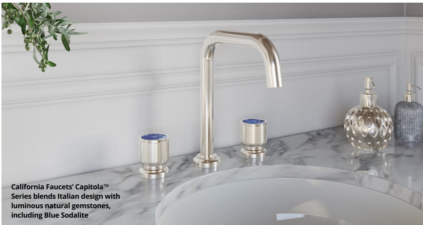
California Faucets' Capitola™ Series blends Italian design with luminous natural gemstones, including Blue Sodalite

The new artfully crafted bath collection blending refined Italian design, exceptional craftsmanship, and rare gemstones transforms daily rituals into something extraordinary