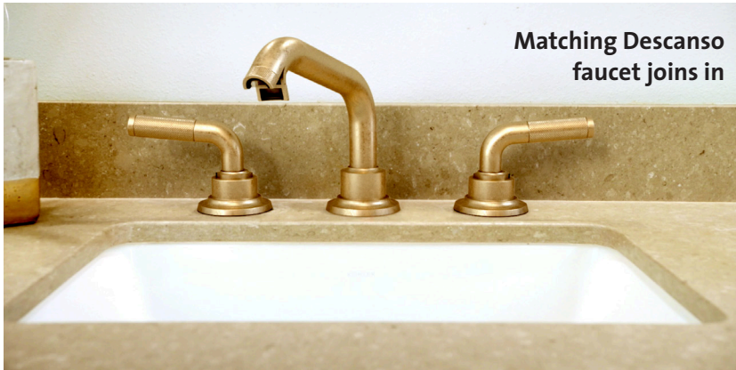
Matching Descanso faucet joins in

“showerhead and handshower” shower system. Energized and inspired by her CGI friends, the woman begins to sing a lively tune with the same sense of freedom she’d have if she were singing alone in the car. And, just as Snow White sang with animated woodland creatures, her friends, the faucets, begin to join in, delightfully harmonizing with their human pal.