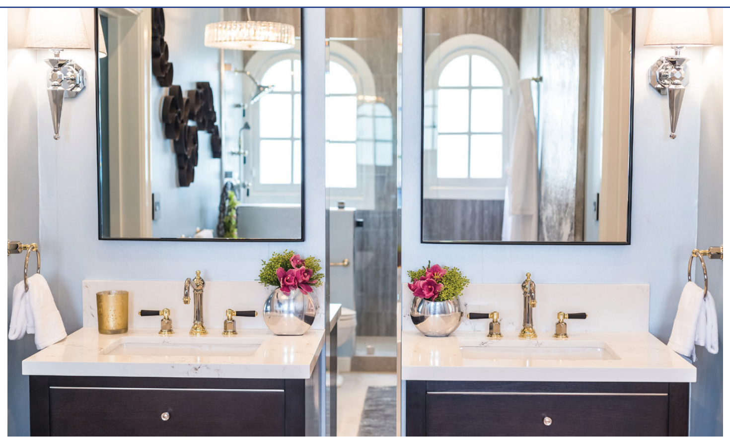
Topanga tri-finish faucet featured at 2016 Pasadena Showcase House