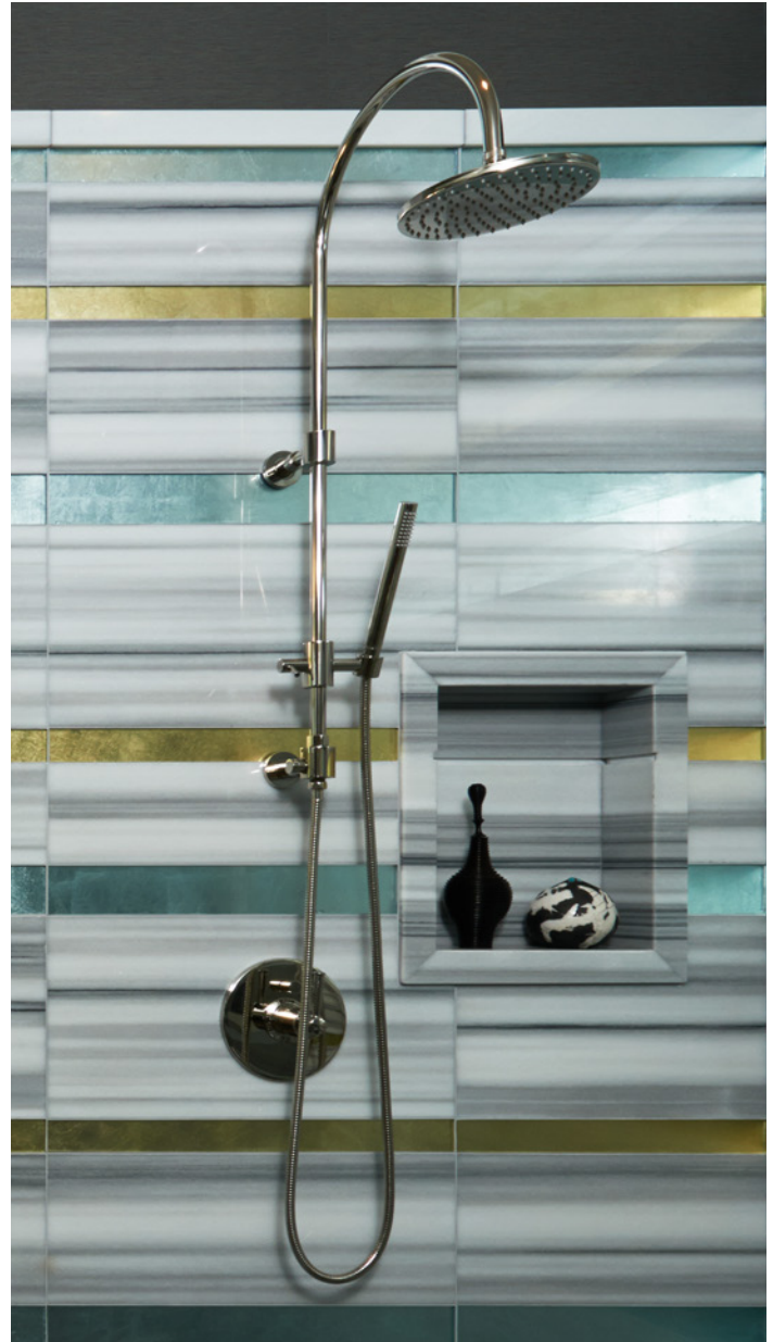
Shower column with 72-jet showerhead and contemporary handshower, together with StyleTherm® displayed in The Gentleman's Suite

Other technology innovations chosen for the event included the CALGreen -compliant version of StyleTherm®