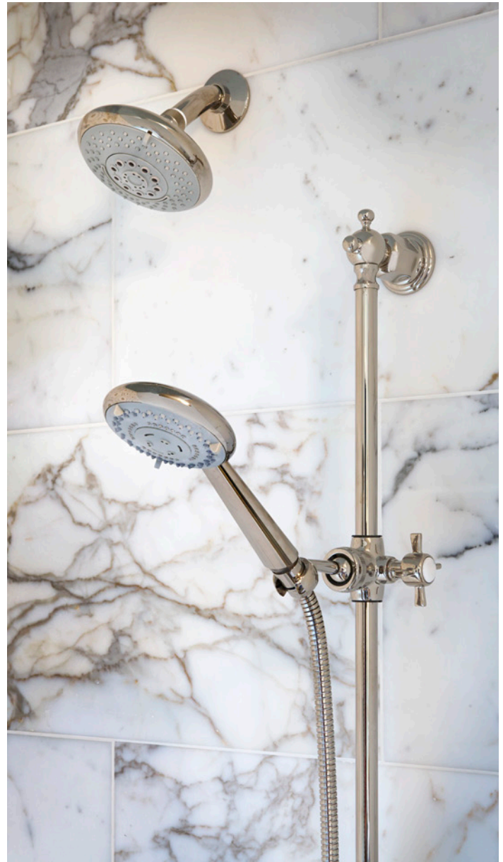
Above: StyleFlow™ showerhead and handshower displayed in The Bedroom Suite; Below: StyleDrain® Tile integrated seamlessly in the shower floor

"We went exclusively with California Faucets for the fittings in The College Man's Suite," said Jerome Thiebault, ASID, and principal designer of JTID Inc. in Los Angeles. The array of available finishes, and the option to use the same finish for all California Faucets fixtures is very unique," he explains. "In addition to the bath faucet, and all shower fittings, we were able to get everything, including towel bars, toilet paper holder, and even the knobs for the vanity, in the same Polished Nickel finish, which offered the perfect balance to the gold and silver used in other areas of the room." Thiebault cites the company's CeraLine® channel drain, winner of six international design awards, as a particularly